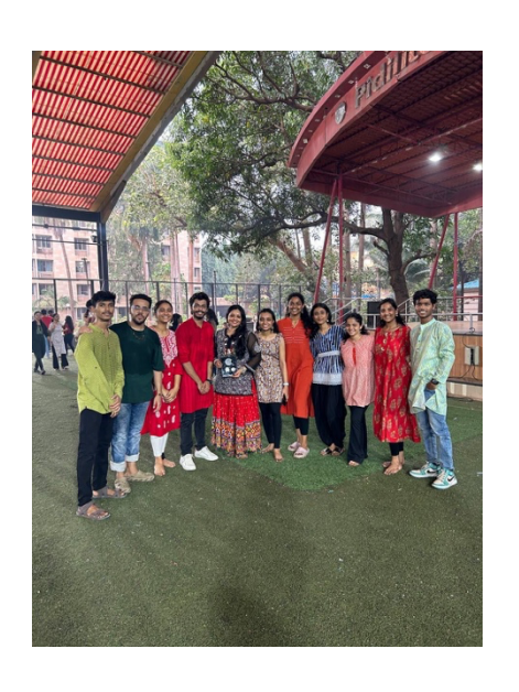
The photo of the core of music club