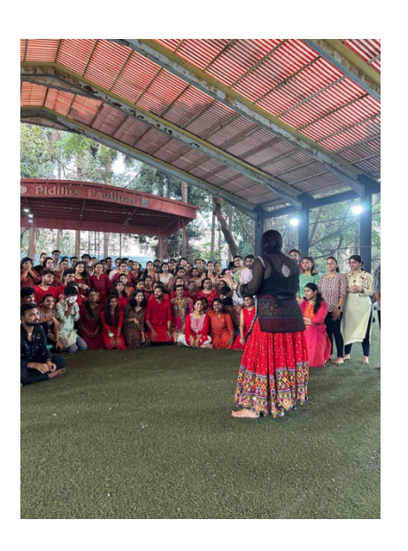
Here, Ma'am expressing her gratitude towards our college and telling us the importance of garba and Indian culture