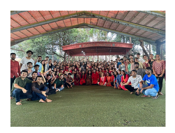
Happy faces after attending the Garba Workshop and taking a picture together to make the event memorable.