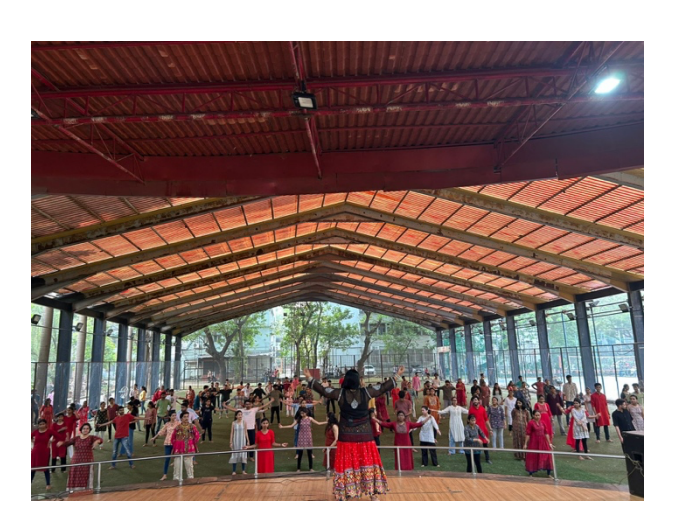
Mam teaching garba to students from basics to some of the core steps of Garba