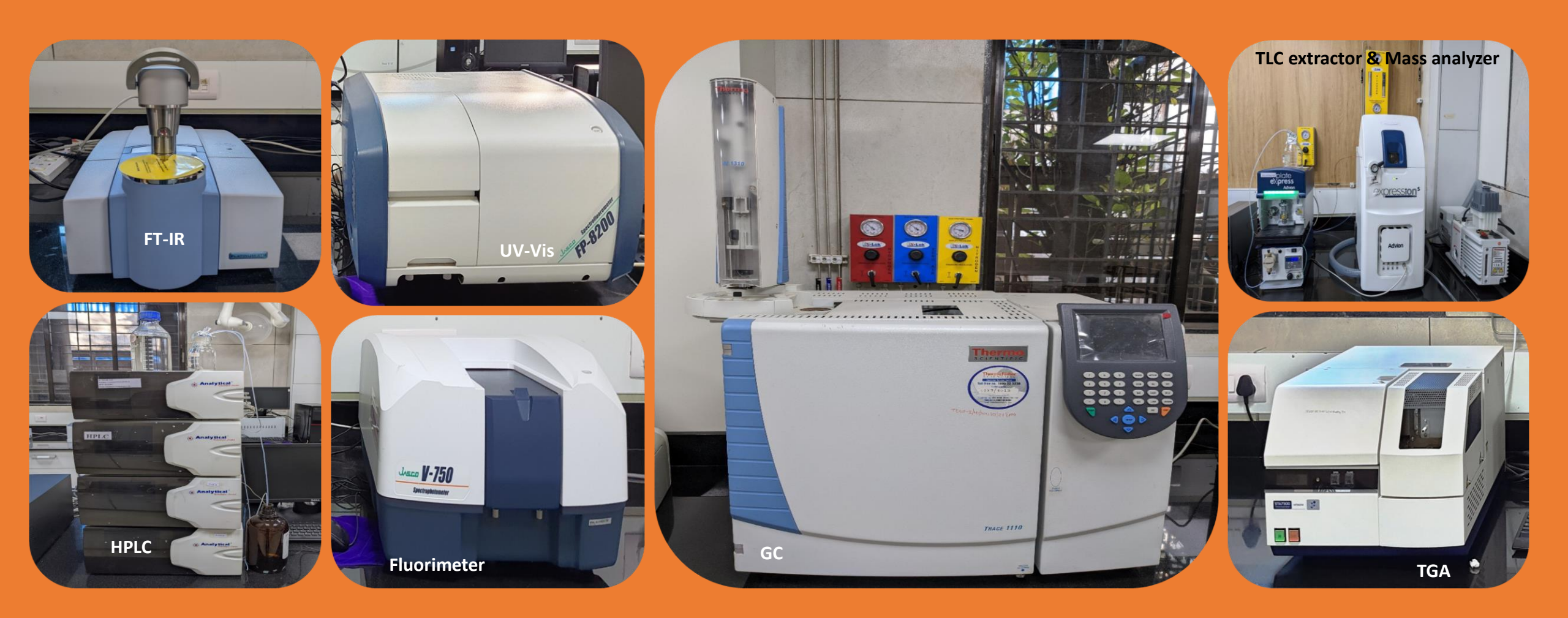
Analytical Instruments Department of Speciality Chemicals Technology, ICT Mumbai