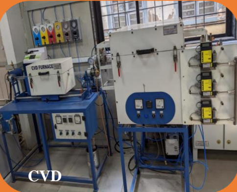
Analytical Instruments Department of Speciality Chemicals Technology, ICT Mumbai